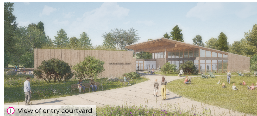
① View of entry courtyard