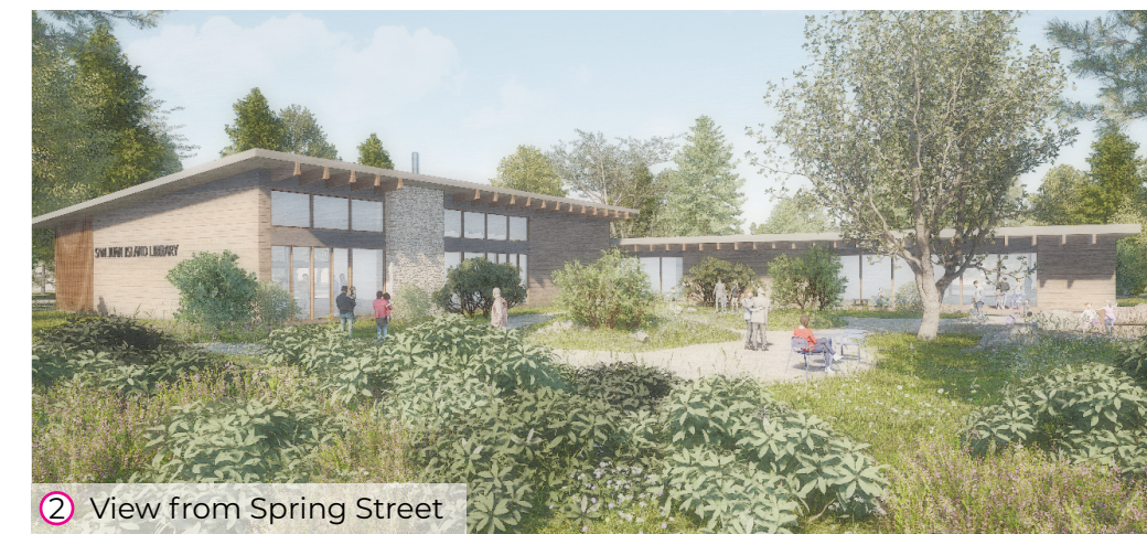
② View from Spring Street