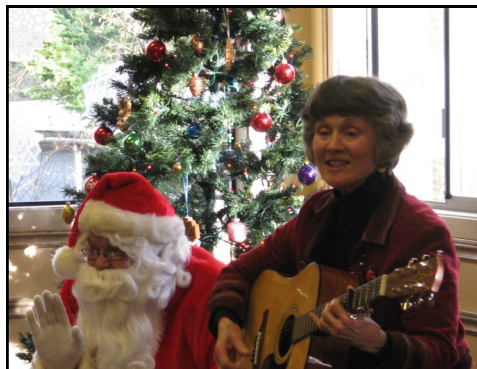
Holiday Party Storytime with Special Guests

On Friday, December 20 we'll also host our annual Holiday Party Storytime with Music and Special Guests. It's a magical month with lots to do at the library!