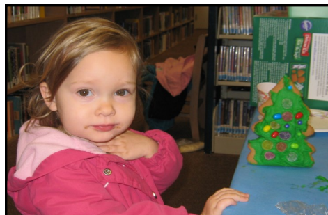
Gingerbread Storytime & Teen Craft