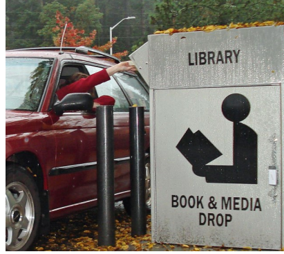
Not to worry: our 2 outside book drops will remain open during the closure.